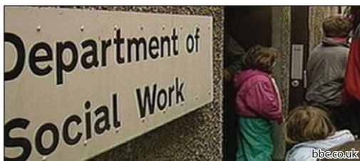
Forceful interview techniques led to false allegations.

The blanket named person proposal will inevitably fail to provide the targeted intervention that is required.