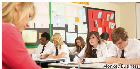
Teachers are likely to be named persons for pupils.

expected that their headteacher or guidance teacher will become the named person. Teachers are already extremely busy, so does the Government seriously